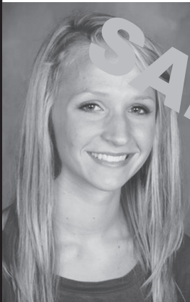
2018 Graduate of W-N HS

You have made us all so proud. Remember to believe in yourself and all your dreams will come true. Best of luck!