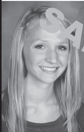
2018 Graduate of OGHS

You have made us all so proud. Remember to believe in yourself and all your dreams will come true. Best of luck!